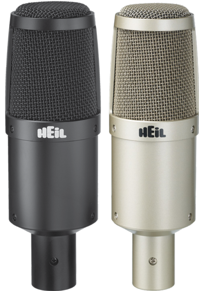
Versions include: PR 30 (Champagne) and PR 30B (Matte Black)